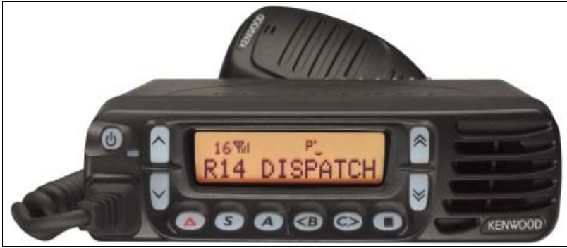
Kenwood TK-x180 Series Mobile Radio with Enhanced FleetSync and GPS