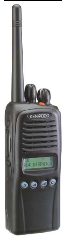
TK-2180 5 watt portable